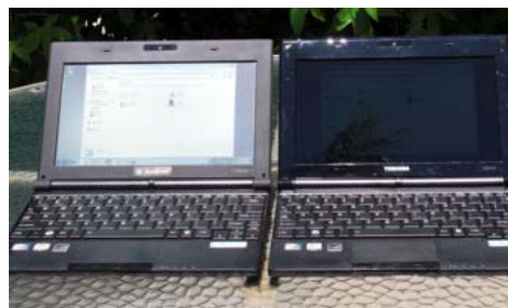
SunBook in Sunlight (on left) Stock netbook is at maximum brightness

The Clover SunBook is a state-of-the-art netbook that uses a PixelQi LED backlit transflective LCD display. This allows you to use the SunBook anywhere from total darkness to direct sunlight, increases the battery life, and reduces eyestrain & headaches.